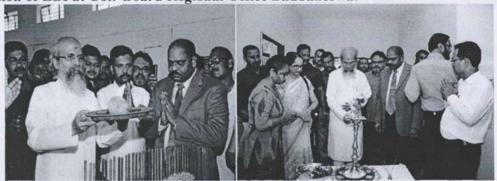
Hon'ble MOS MSME, Shri, Pratap Ch. Sarangi inaugurates the "Livelihood Business Incubation Centre" at Coir Board Regional Office Bhubaneswar

Inauguration of LBI at Coir Board Regional Office Bhubaneswar