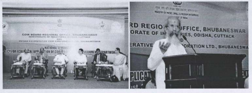
Hon'ble MOS MSME, Shri, Pratap Ch. Sarangi delivers inaugural address during national seminar held at Bhubaneswar on 24<sup>th</sup> August 2019.

National Seminar on "Policy for eco-logical application of coir products in Govt. departments" was conducted at Bhubaneswar.