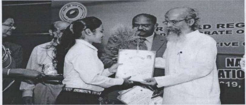
Certificate distribution to the passed out trainee of NSQF level 3 training (6 months duration) by Hon'ble MOS MSME, Shri, Pratap Ch. Sarangi

Certificates distributed to the passed out trainees of NSQF level 3 training (6 months duration) at Bhubaneswar by Hon'ble MOS MSME