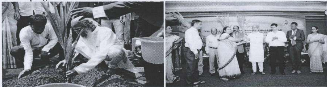
Hon'ble MOS MSME, Shri, Pratap Ch. Sarangi distributed Coconut saplings to SFURTI coir clusters under Swatchha Bharat

Coconut saplings distributed to SFURTI clusters under implementation of Swatchha Bharat programme at Bhubaneswar