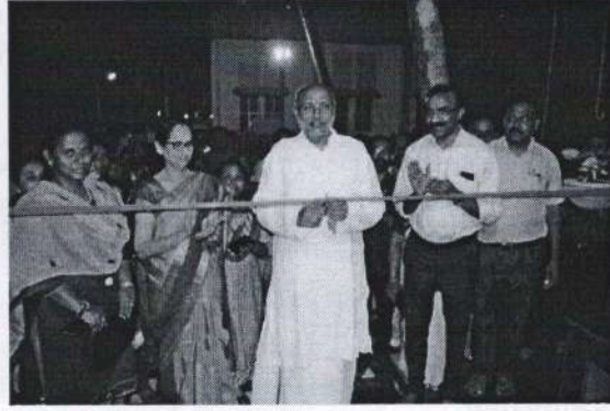
Shri. CP Radhakrishnan, Chairman, Coir Board, inaugurating the Model Demo Centre showcasing the technologies developed by CCRI/CICT