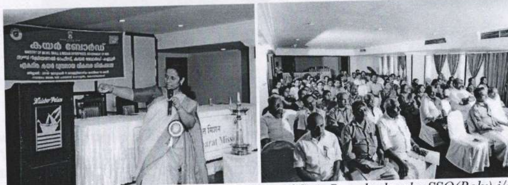
A technical session on R&D activities of Coir Board taken by SSO(Poly) i/c