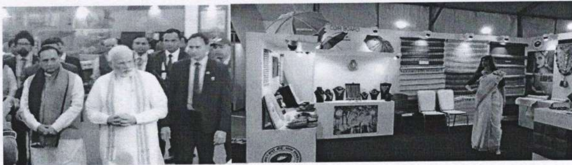
Hon'ble Prime Minister Shri. Narendra Modi visits Coir Board Pavilion at Vibrant Gujarat Global Summit

Coir Board has participated in the Theme Pavilion of Ministry of MSME at the “9 th Vibrant Gujarat Global Summit” held at Gandhinagar from 18 th to 23 rd January 2019. The Pavilion was visited by the Hon’ble Prime Minister Shri. Narendra Modi on 17 th January 2019. All the technologies for modernization of the coir industry and skill development for production of diversified coir products were displayed in the pavilion. The Pavilion attracted large number visitors from all over the country.