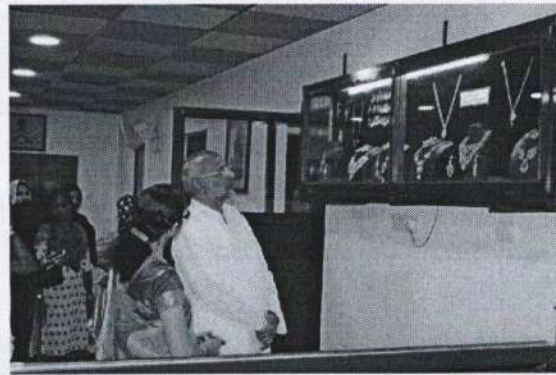
Shri. CP Radhakrishnan, Chairman, Coir Board viewing the demonstration of technologies