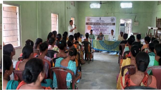
One Awareness Programme in connection with MSME week organised by SRO Kolkata at Priyadarshini Guest House, Kapasaria, Mahishadal, Purba Medinipur District on 30.06.2022. 50 participants were attended the programme