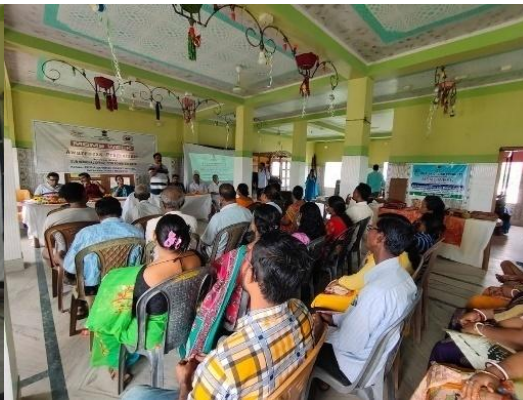
As part of MSME Week, Coir Board Regional Office, Kalavoor has conducted three days Entrepreneurship Development Programme (EDP) from 30 th June to 2 nd July- 2022 at Kochi's Conference Hall, Mannar, Alappuzha