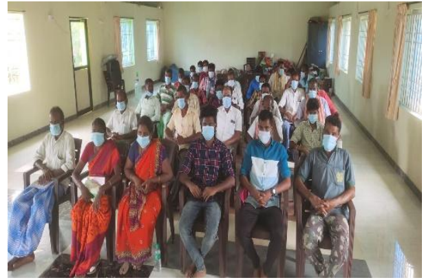
One day Awareness Programme on Coir Fibre Extraction by utilising the locally available raw material has been conducted at Baganpara, Baksa District, Assam (Aspirational District) on 2 nd July 2022 during the MSME week from 27 th June to 3 rd July 2022